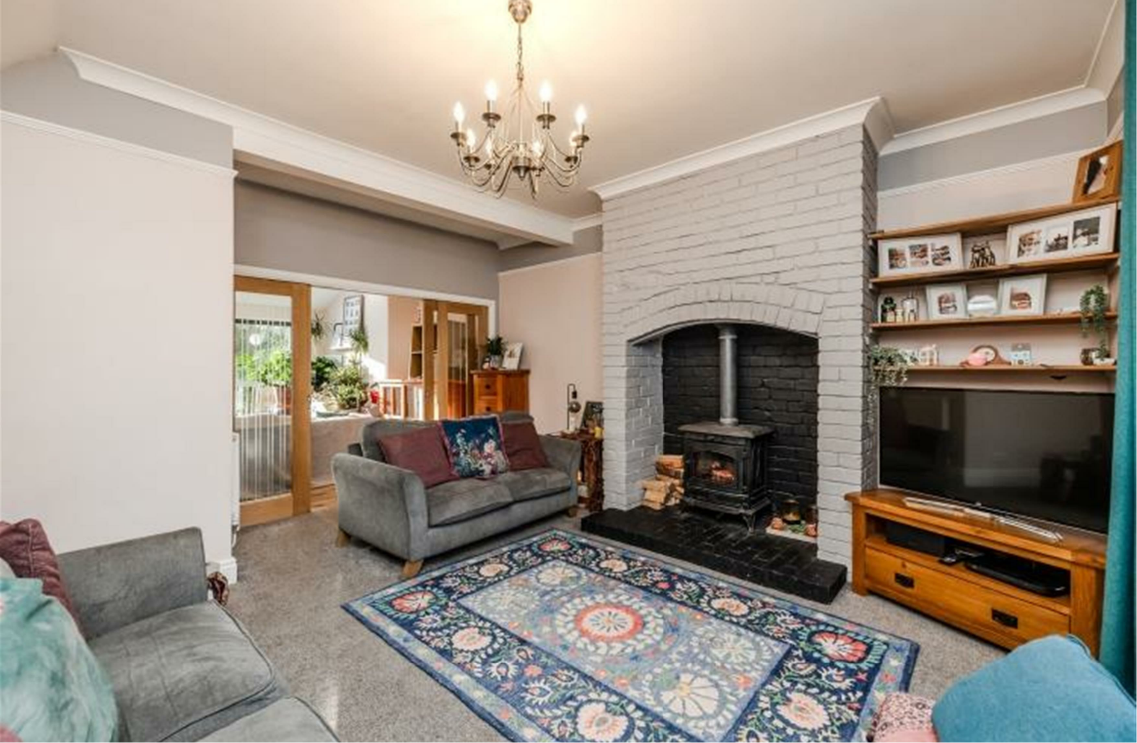
20 Coronation Road, North Walbottle, Newcastle upon Tyne, NE5 1PU